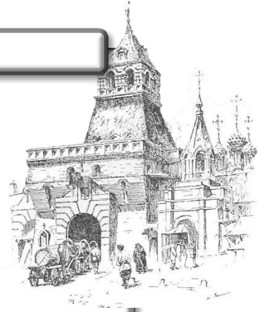
MOSCOW (c. 1280s)