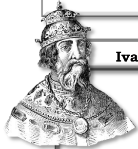
Ivan III "The Great" (r. 1462-1505)