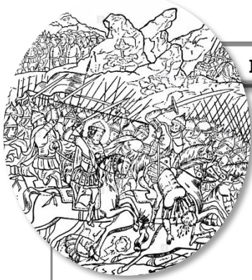
Battle of Kulikovo (Sep. 1380)